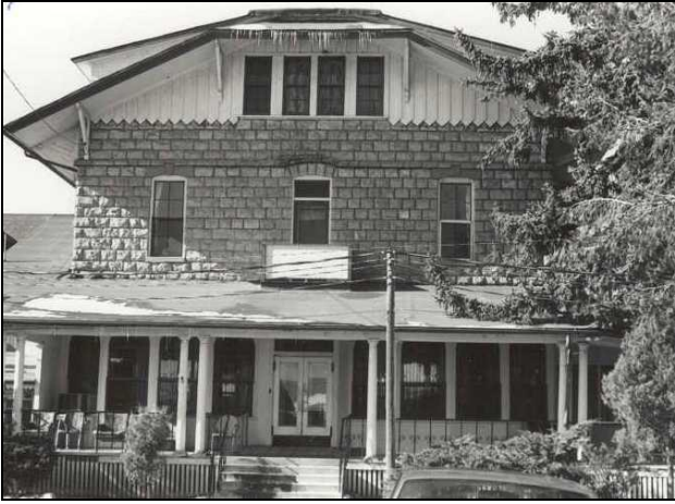
As Pine Haven Manor, 1976