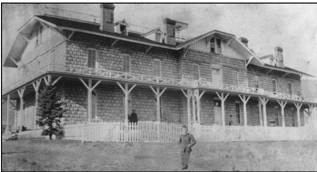
Swiss Cottage in the 1880s

* Elements of style suggest George Morrison was the builder; other evidence suggests that this building was built by another company. It is often cited as "built by Governor Evans" as in the next article. We believe Evans was the source of funds for the building. It is also possible that Morrison built other buildings in town. — Ed.