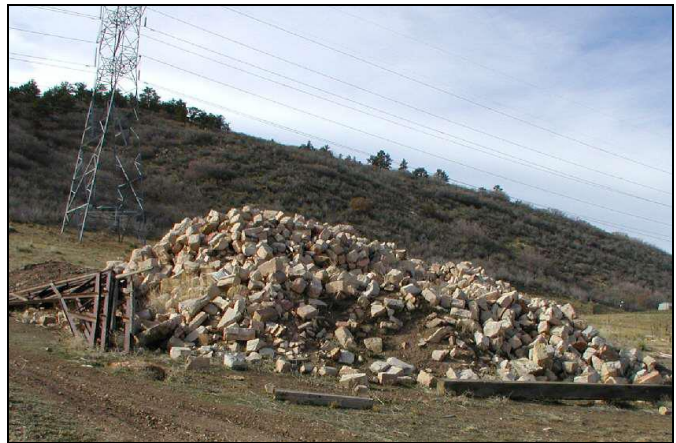
Carefully shaped building stones, now a pile of rubble, 2002

See also: Jesuits in Jefferson County , Historically Jeffco magazine, 2004, p 30-34.